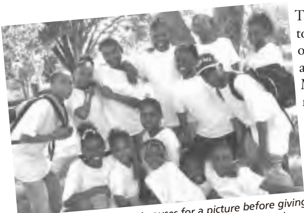
'Major Topps Drum Troupe' pauses for a picture before giving a great, energy-filled performance in the FRNNG Parade.

Thanks also to all the volunteers who helped out the day of the events and to all the staff and volunteers at McRae Park. See you all again next year!