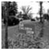
WE'D LIKE TO SEE