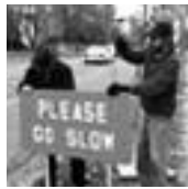
PLEASE GO SLOW