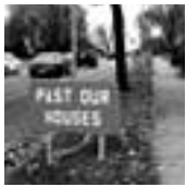
PAST OUR HOUSES

The first week of November, CAU created and installed “Burma Shave” inspired signage between 45th and 46th Streets. Look for additional signs in the next few weeks.