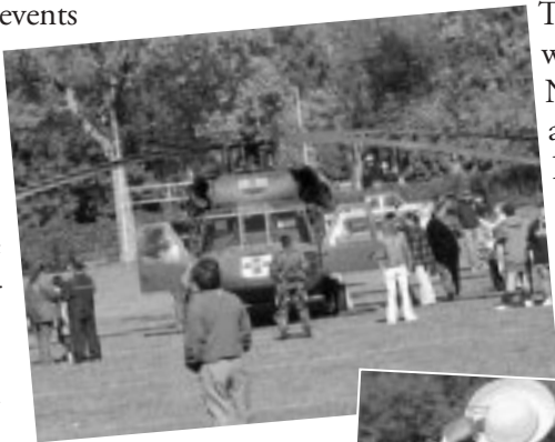
above: The Army National Guard landed in a helicopter to kick off the celebration

The Anniversary wrapped up with the Annual Neighborhood Celebration at McRae Park and a big Block Party with special appearances by the National Guard, Fire Department and elected officials.