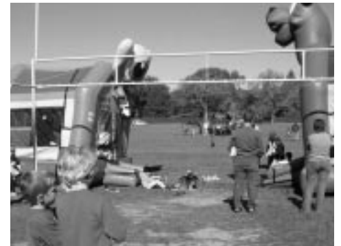
Scooby Doo and Blossom face off in the moonwalk, and in the end, Scooby was no match for the super hero