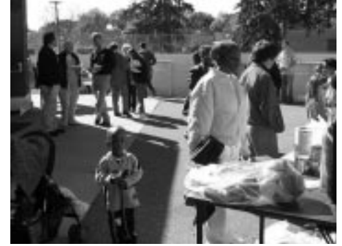
Everybody wants a piece of the raffle

A special "Thank you" to everyone who participated.