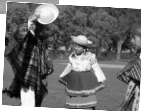
right: The Ecuadorian dancers performed late in the afternoon to help wrap up the celebration

Events included a raffle, lunch, moonwalk, face painting, and performances by the McRae Jazz Band and